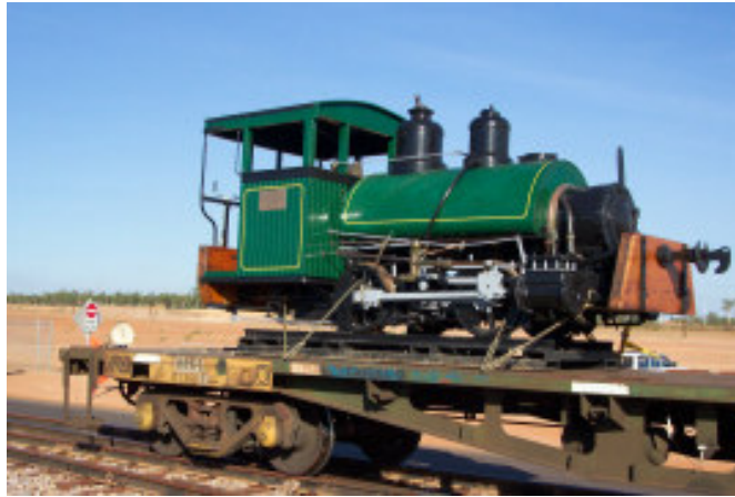
Sandfly as she arrived in Darwin in July 2004. Her arrival was not announced, and we were stunned to see her go through Adelaide River hitched to the end of The Ghan!