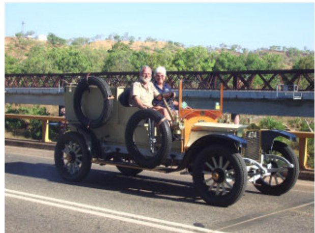
Crossing the Edwin Verberg Bridge.