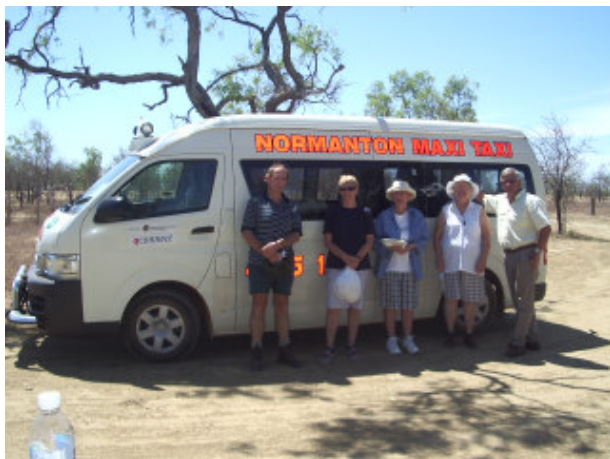
The crew of the 2008 expedition at Burke and Wills 1861 Camp #119

We found that the butcher is the local rent-a-car man and Doug kindly hired the Maxi Taxi to us for the day at very favorable rates.