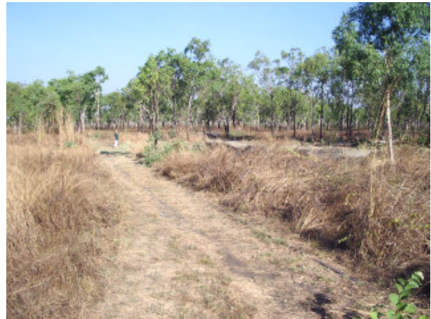
Discovery of the pit in August this year