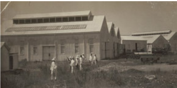
Parap Railway workshops, 1912: visiting Parliamentary delegation (hence the white suits!)

After the bombing raids in February 1942, the railway activated its Emergency Plan and evacuated the whole workshop operation to Katherine. A large workshop was established by the river bank (the RSL is on part of the site now) and all equipment from Parap was relocated to what was called 'The Evacuated Workshop' at Katherine. This included the wheel lathe, and thanks to a military photograph we have the only image of the lathe in action.