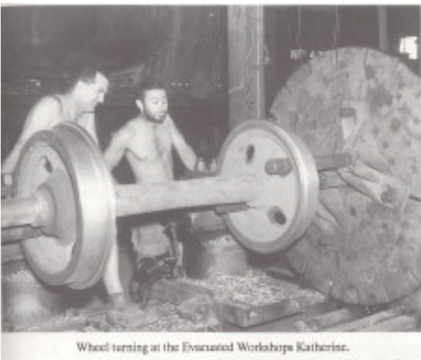
Wheel turning at the Evacuated Workshops Katherine.

Stan Kennon purchased the lathe from the