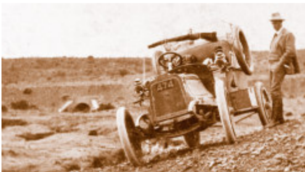
At Oodnadatta 100 years ago. The Great Northern railway line embankment can be seen.

In fact, the Talbot was the first self-propelled vehicle ever seen by many people in remote regions.