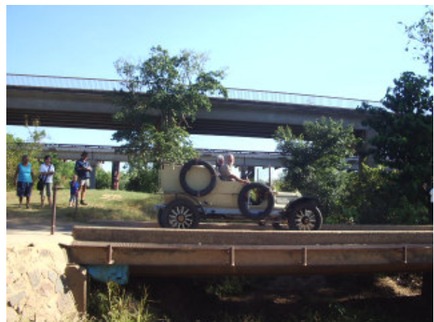
The Talbot crossing the Adelaide River and, right, the Talbot crossing the low level bridge 100 years on.