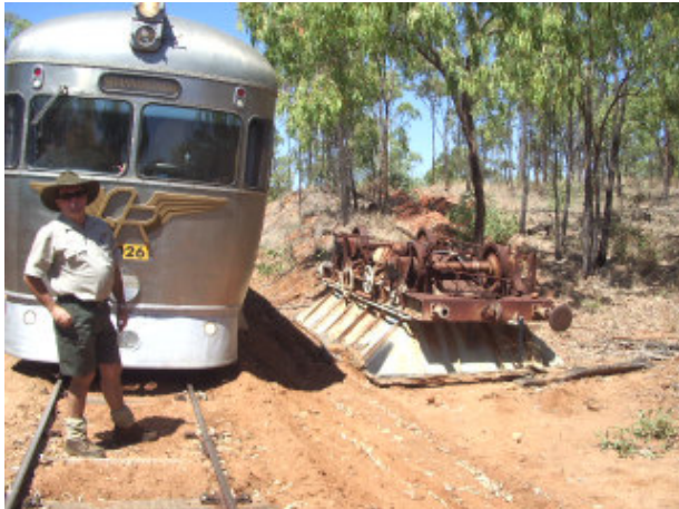
A vintage upturned hopper wagon - identical to hoppers on the NAR of which some came from Chillagoe. If only it were closer!!!