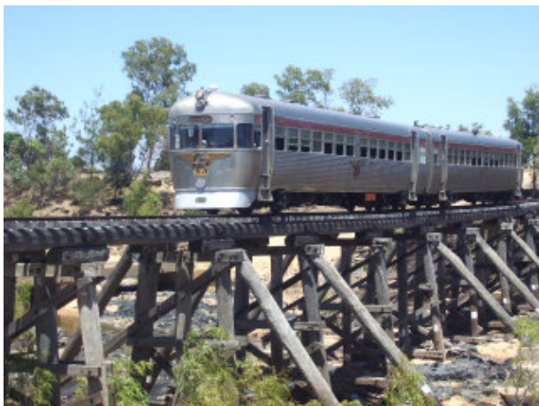
Crossing Copperfield Gorge at Einsliegh after stopping for lunch at the pub

Chillagoe Mining Company (cheaply) to supply ore to its huge smelters.