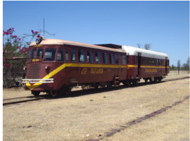
The Gullflander paused at BlackBull to give passengers a cup of tea.

The train trip to Croydon was leisurely (about 20 mph) and lasted from 8.30am until 2pm. We crossed flood plains