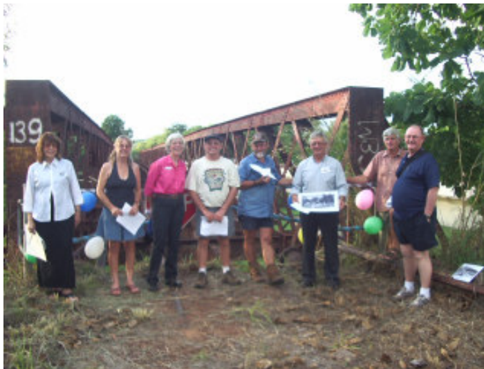
The small gathering at the bridge on 3 December.

On Wednesday 3 December 2008, a small birthday celebration was held on site to commemorate the vision and toil of those hundreds of workers who, during the 1888 Dry Season, created this engineering marvel.