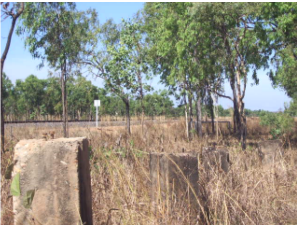
Remnants of the foundations

We have mountains of ash which suggests that a lotta shoveling was done up until 1954, although the majority of it was done during WW2.